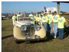
1948 drop head coupe