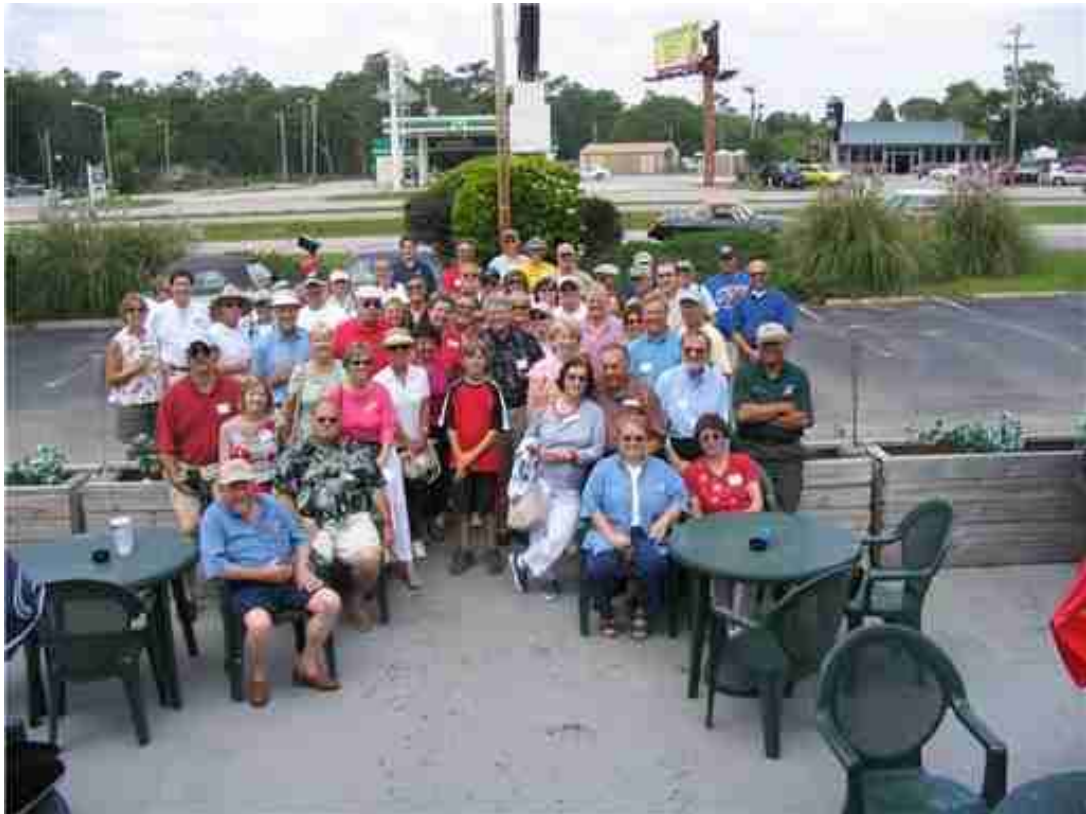
Lot's of happy folks from BMCCF and the Charleston British Car Club Waiting to sample the "pub grub" at the Royal Oak