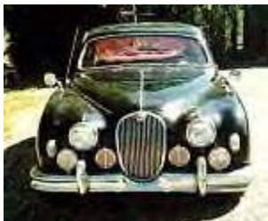
1958 Mark VI