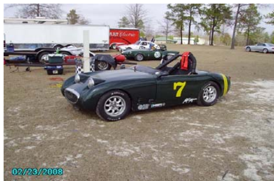
Bugeye Racer At Carolina Motorsports Park