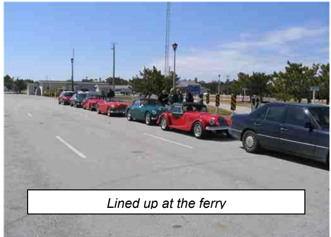
Lined up at the ferry

We joined up again for dinner at the Weeping Radish Restaurant in Manteo. The Radish is a bona fide Bavarian pub serving some of the best German food I've ever tasted. Maybe not for everyone, especially if you're on a diet, but after a full day of driving it's a great place to relax, eat and drink some really great beer brewed right on the premises. If you want to sample some, they have it on tap at Fat Tony's on Front Street.